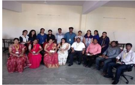
Teacher's Day Celebrations