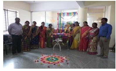
Ayudha Pooja Celebrations At the Department