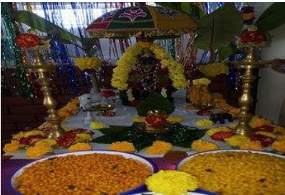
Goddesses Saraswathi on Ayudha Pooja