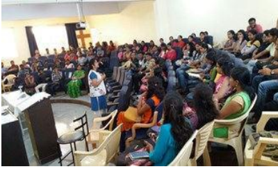
Session on Entrepreneurship Awareness Camp