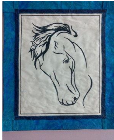
Art by P S Krutika, 7 th sem