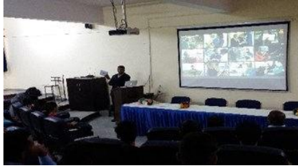
Session on Apple Mobile App Development