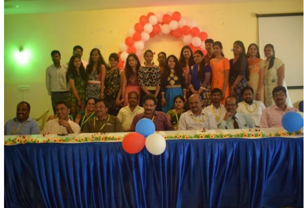
Farewell Party By Juniors to Seniors