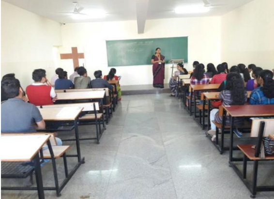
Orientation Day Program