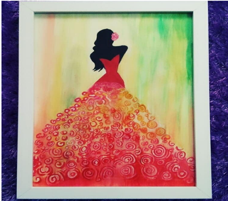
Art by P S Krutika, 8 th sem