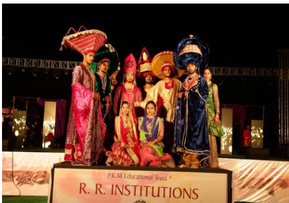
ISE Students IN Fashion Show won 1st prize from RRIT