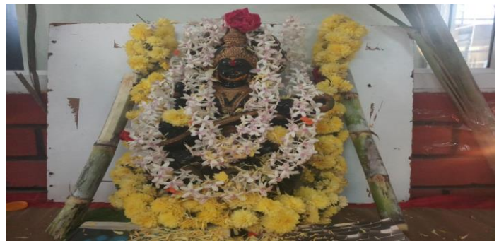
Goddesses Saraswathi Pooja on Ayudha Pooja Day