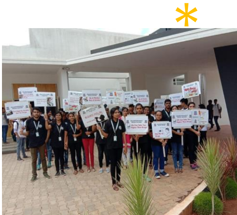
ISE Students in NSS Activities