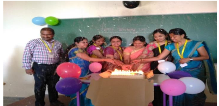
Teacher's Day Celebrations on Sept 5th 2018