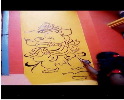
Wall ART By Niveda Ramesh 5th sem