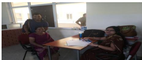
Parents Meet up with Proctors