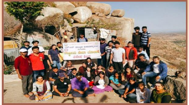
NSS camp at Siddharabetta.