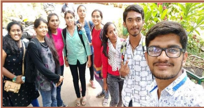
Open day at IISc, Bangalore